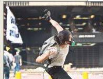
Apedrearon la sede del MP. ÁNGEL COLUMENARES

Heading in English: “two people killed after protest.”