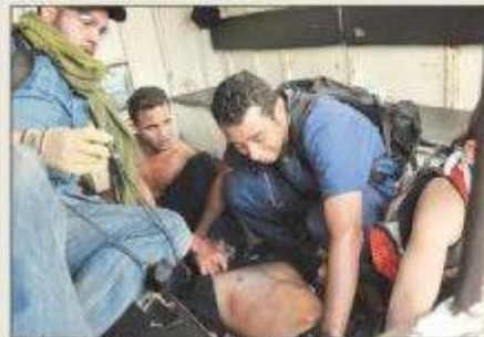
Tiroteo dejó lesionados en el centro. CRISTIAN HERNÁNDEZ