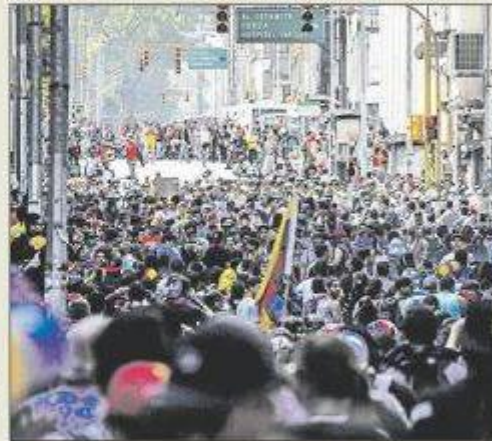
Hubo tiroteos y destrozos en Av.Universidad.